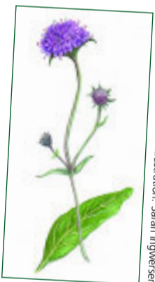
Illustration: Sarah Ingwersen

Walking up the track towards Whitstones Farm, you will see the first of two lime kilns on the route. There are a number of disused limestone quarries dotted about this landscape and farmers would have used the burnt lime from the kilns to put calcium, leached out by heavy rainfall, back into the soil.