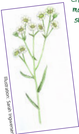
Illustration: Sarah Ingwersen

Roadside verges are often an important refuge for wild flowers characteristic of hay meadows such as sneezewort.